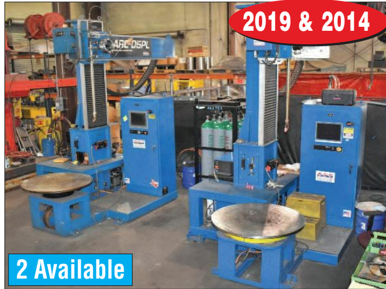
ARC ARC-05PL VERTICAL CLADDING SYSTEMS