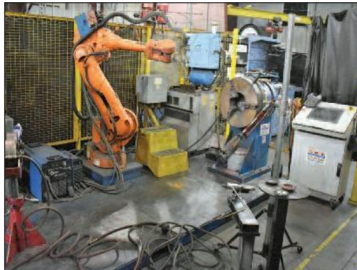
RED-ROCK COLUMN & BOOM ROBOTIC WELDING CELL