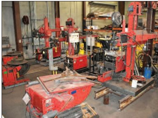
COLUMN & BOOM MANIPULATOR CLADDING SYSTEMS