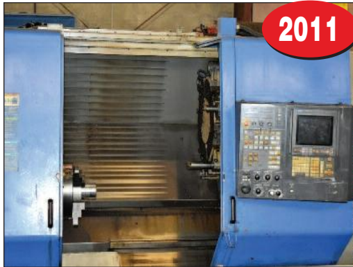
DOOSAN PUMA 480L CNC TURNING CENTER