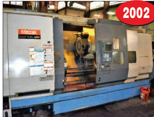
MAZAK SLANT TURN ST-450 CNC LATHE