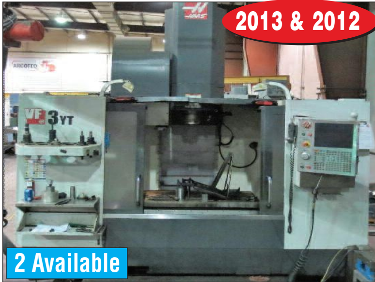
HAAS VF-3YT/50 CNC VERTICAL MACHINING CENTERS