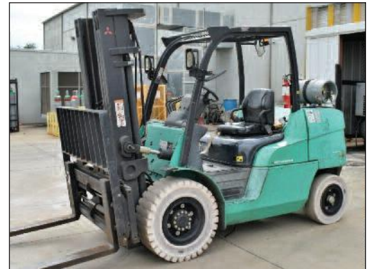
ASSORTED MITSUBISHI LP GAS FORKLIFT TRUCKS