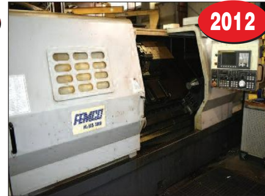
FEMCO HT-555 2000 CNC LATHE